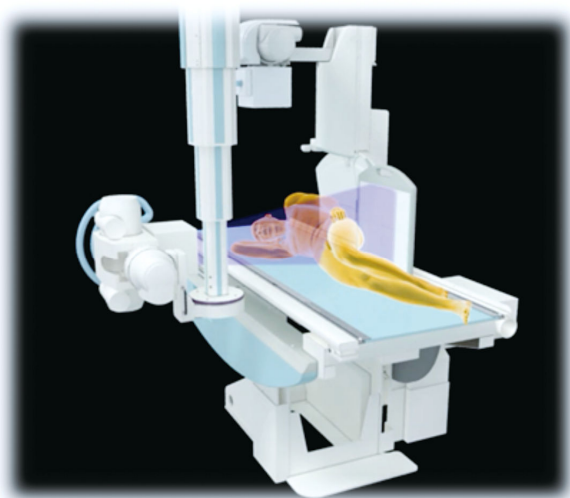
Fig. 5 Decubitus Radiography

When the FPD is mounted in the optional FPD holder, lateral radiography is possible using a second X-ray tube. This is effective for radiography in the decubitus position ( Fig. 5 ).