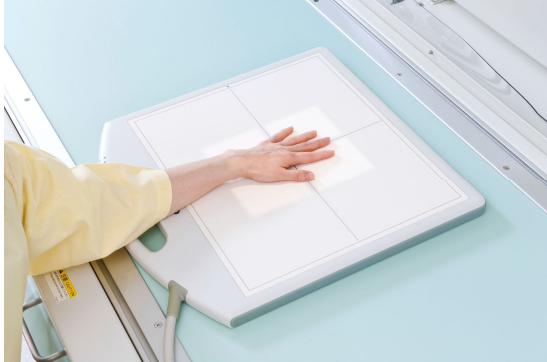
Fig. 4 Tabletop Radiography of Limbs and Hands

The portable FPD can be removed from the R/F table to perform radiography. The limb or hand to be examined is placed in direct contact with the FPD and radiography is performed on the tabletop ( Fig. 4 ).