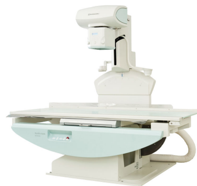
Fig. 1 FLEXAVISION F3 Package

The FLEXAVISION F3 Package exploits the advantages of the portable FPD to support plain radiography and a variety of other examinations, such as lateral radiography on the tabletop and chest radiography 2 in a standing position on the bucky stand.