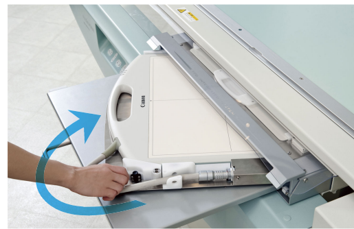
Fig. 2 Rotating the FPD

The 17"×14" FPD can be rotated in its tray as required to switch between portrait and landscape orientations. In the portrait orientation, it can capture images covering the kidneys and bladder during drip infusion pyelography (DIP). In the landscape orientation, it can image the pelvis of a subject with a large body type in a single image.